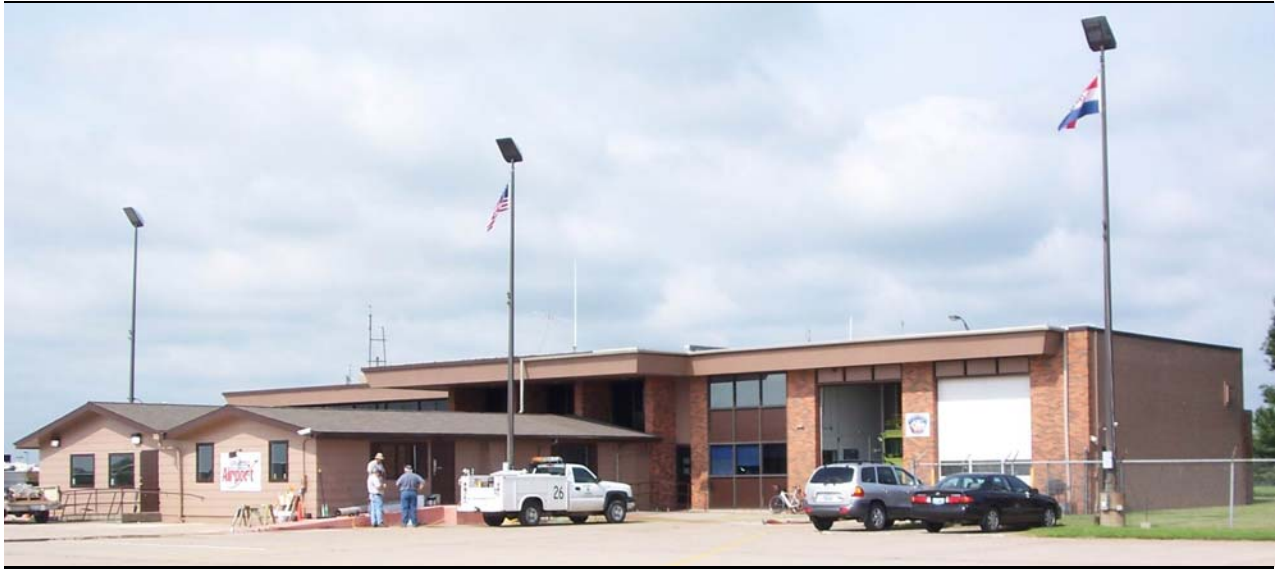
Figure G-3 VIEW OF THE EXISTING TERMINAL FROM THE APRON

The estimated square foot area of each of the existing terminal functional spaces as well as the overall area of the building is found in Table G-1. These areas were taken from the drawings shown in Figure G-2 and were rounded.