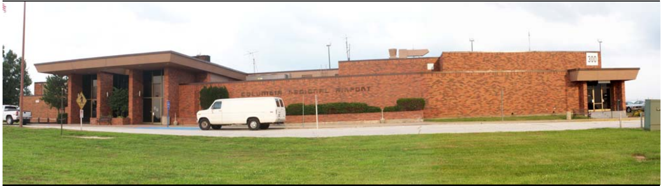
Figure G-1 EXISTING PASSENGER TERMINAL

The ground or first floor of the terminal encompasses the public passenger areas, which include two public entrance vestibules, the lobby, two sets of ticket counters, two rental car agency offices and counters, baggage claim area, the deplaning corridor and restrooms. Airline operating spaces include their offices, operations areas, and storage. The security functions of the passenger terminal consisting of the passenger security check point, a secure passenger holdroom, and offices and support areas for the Transportation Security Administration (TSA) are also accommodated on the first floor.